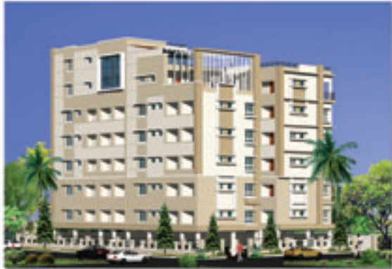
SHIRI PARKVIEW Apartments, Ramnagar

Construction of Villas, Duplex Houses, Luxury Homes, School, Residential Apartment, Community Hall, Commercial Establishments etc., besides Keshava Reddy School, 80 Feet Road in Ramnagar extension.