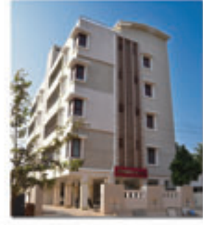
SHIRI AVENUE Apartments, Ramnagar