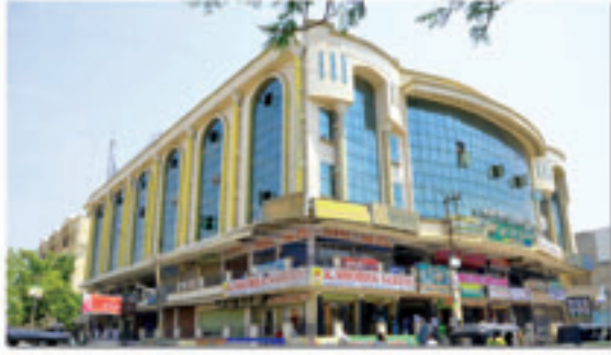
RAGHUVIERA TOWERS, Subash Road